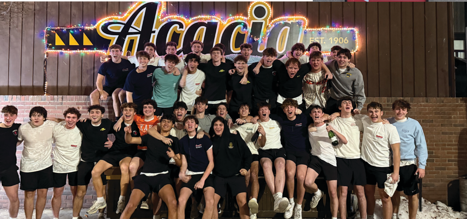
(Below) Brothers show Acacia pride at the chapter house.