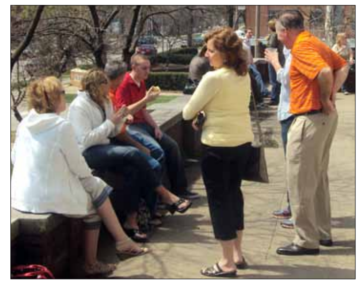
Mother's Weekend - The attending mothers and sons enjoyed conversing with each other as well as the provided lunch.