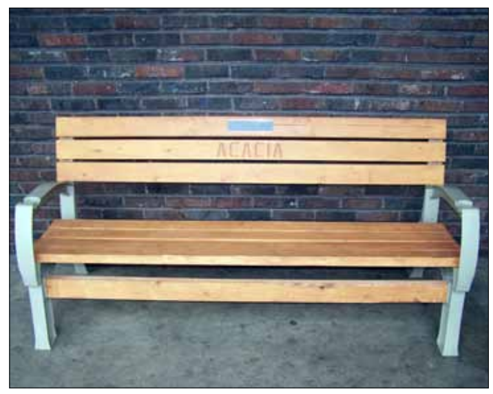
One of eight benches purchased by the Corporation for use outside in the porch area.