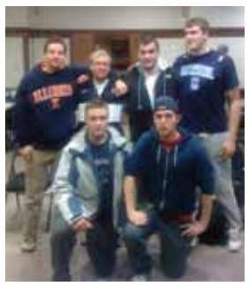
Pledge Class - Spring 2010.