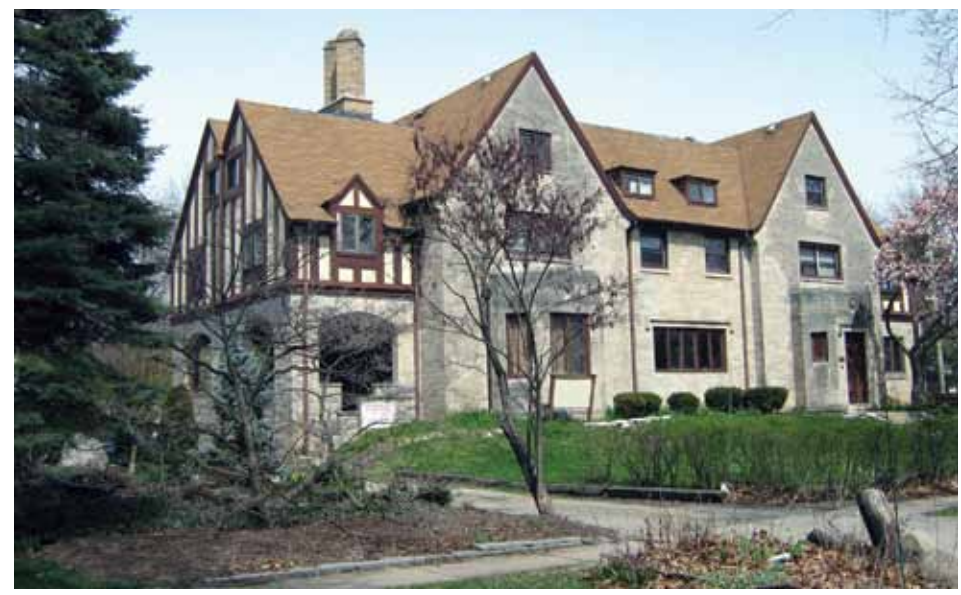
Pictured above is the newly leased Acacia Fraternity house at 606 E. Ohio. Occupancy will begin with the fall semester 2010. Capacity is approximately 46 members and includes 14 parking spaces in the rear

If we thought buying real estate in the Champaign Urbana area was a challenge, we found that locating and obtaining leased property is a close relative. While some new apartments, suites and other student housing remain vacant, finding acceptable property for relatively short term use is not an easy task.